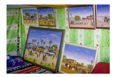
WINDHOEK 'REDEFINED' TOUR