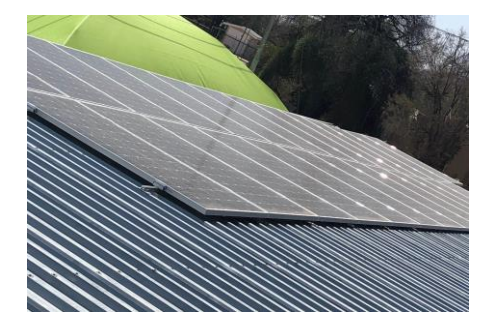
STAINABLE MANAGEMENT PRACTICES