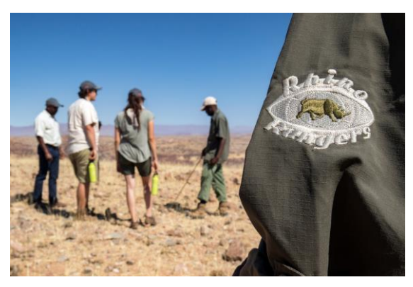
PACK FOR CONSERVATION