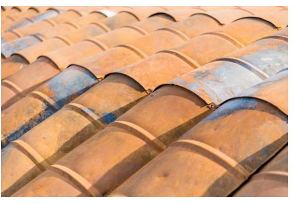
REUSED, RECYCLED & COMPLETELY SUSTAINABLE