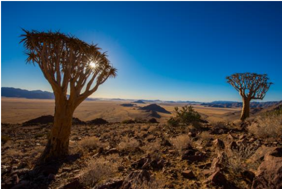
NAMIB TSARIS CONSERVANCY