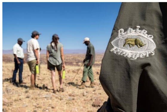
PACK FOR CONSERVATION