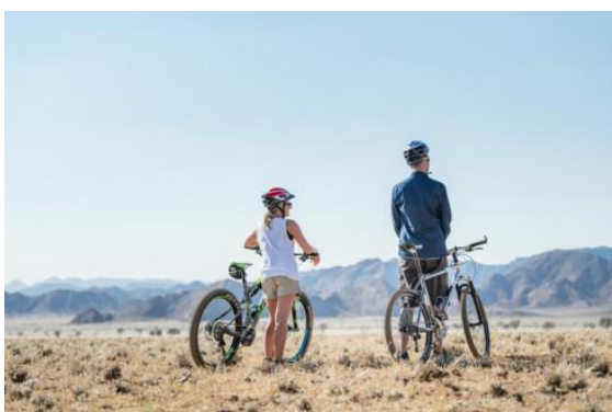
MOUNTAIN PLUS BIKING