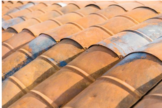
REUSED, RECYCLED & COMPLETELY SUSTAINABLE