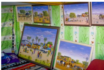
WINDHOEK 'REDEFINED' TOUR