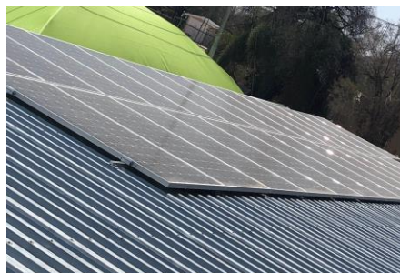
STAINABLE MANAGEMENT PRACTICES