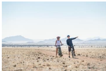
WINDHOEK MOUNTAIN BIKING