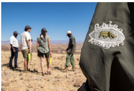
PACK FOR CONSERVATION